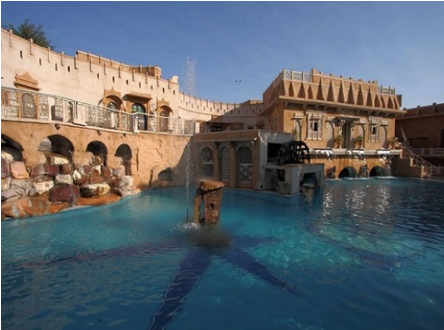
Pool At Ajit Bhawan

Ajit Bhawan has a unique and lavish swimming pool. Keep in shape at the gymnasium equipped with fitness facilities. Health Center with Spa facilities also available. Shopping arcade with boutique shops. There is a museum with an amazing fleet of vintage cars belonging to the Jodhpur Royal Family .