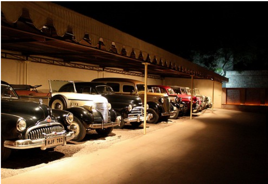
Classic Car Collection At Ajit Bhawan

Jodhpur is called the Gateway to Thar , as it is literally on the edge of the Thar Desert . The Mehrangarh Fort dominates the city and is the largest fort in Rajasthan . Founded in 1458 as the site of Rao Jodha's new capital — hence the name, Jodhpur — the city has grown around it, and in the 500 years that have passed the fort has never been taken by force. It occupies the entire top of a 150-meter hill with commanding views all around, with some three kilometers of massive ramparts built around the edges.