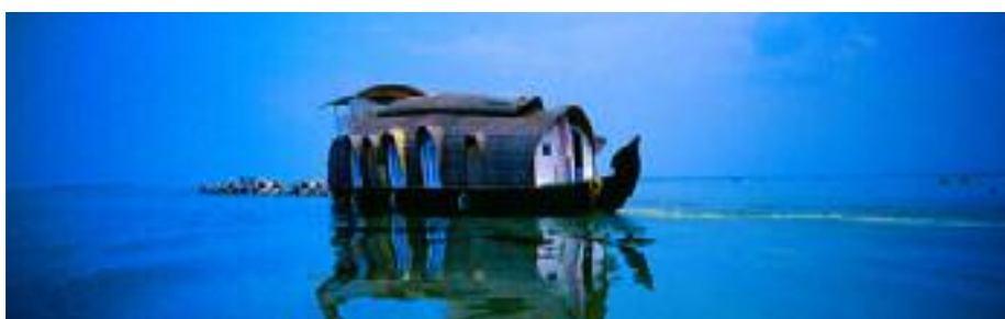
Rice Boat On Shores Of Vembanad Lake