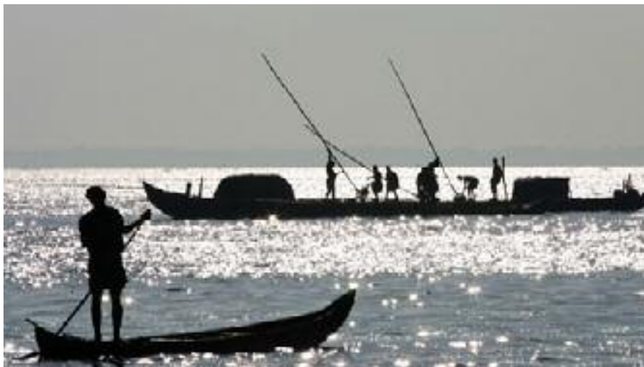
Vembanad Lake At Kumarakom