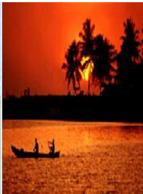
Extraordinary Natural Beauty At Kumarakom