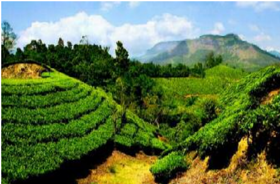
Tea Estates At Munnar

Eravikulam National Park is the last refuge of the Nilgiri Tahr . Half the world population of this rare mountain goat is found here, which is fast becoming extinct.