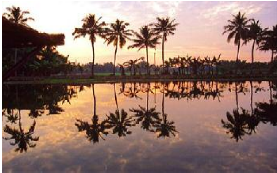
The Backwaters At Kumarakom