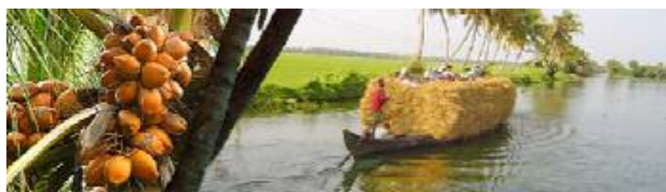
Kerala's Stunning Backwaters

Featured Hotels Dependent On Availability At Time Of Booking