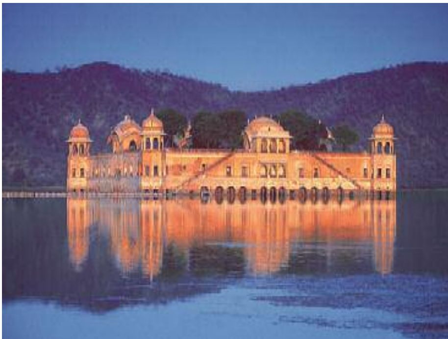
The Beautiful Jal Mahal Palace At Jaipur

Amber is situated about 7 miles from Jaipur and was the ancient citadel of the ruling clan of Amber . The Amber Fort (1592) set in picturesque and rugged hills is a fascinating blend of Hindu and Mughal architecture. The forbidding exterior belies an inner paradise with a beautiful fusion of art and architecture. You have the added attraction of an Elephant Back Ride to ascend to the top.