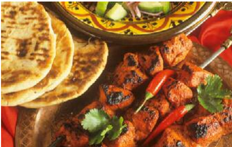
Delicious Delhi Cuisine

Rajghat , the cremation site of Mahatma Gandhi is also a popular place for visitors.