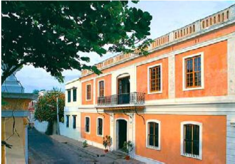
French Quarter At Pondicherry