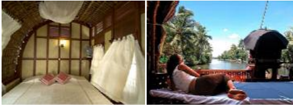
View Of Deluxe Bedroom And Backwaters Riceboat Journey