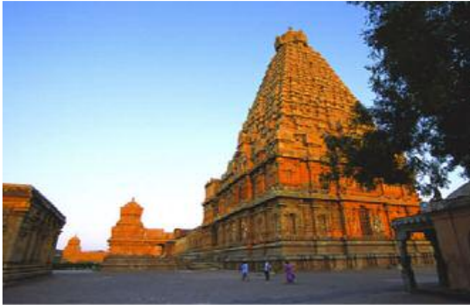
The Majestic Sri Brihadishwara Temple At Tanjore