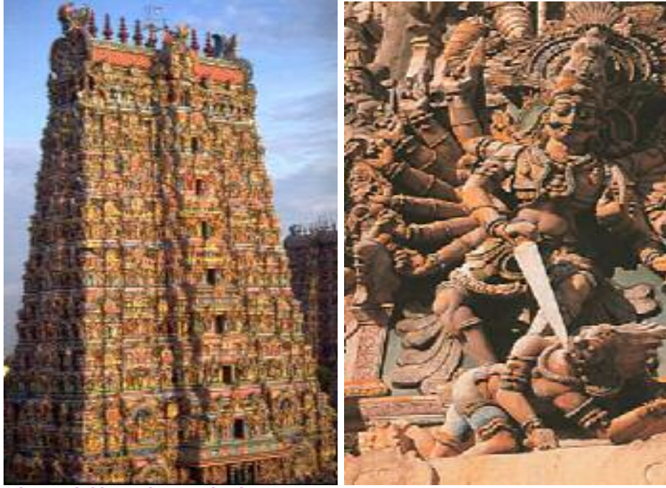
Sri Meenakshi Temple At Madurai