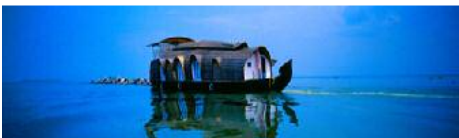
Rice Boat On Shores Of Vembanad Lake