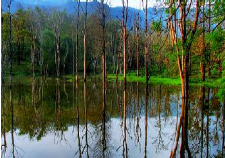
Scenic Beauty Of Ooty