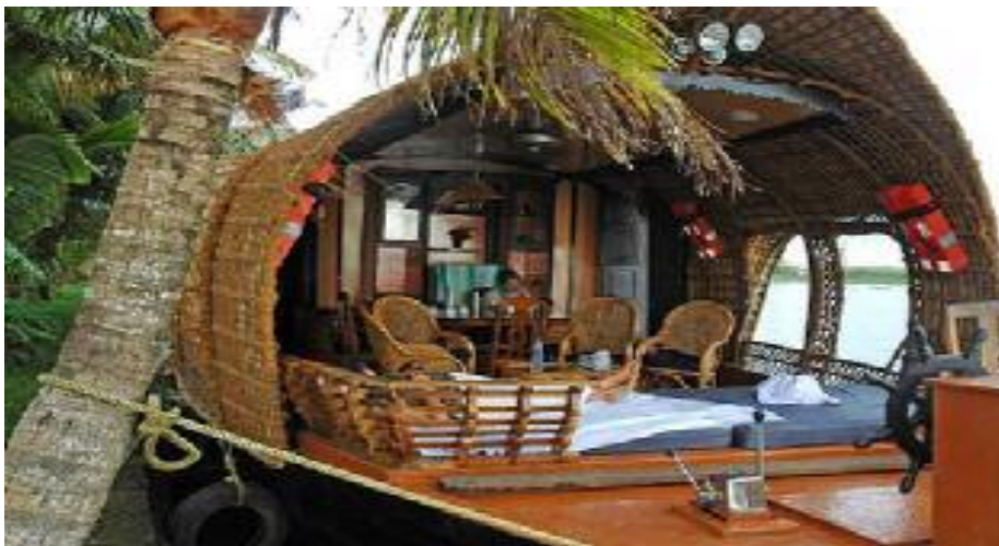
Rice Boat Interior

The canals and lagoons are lined by swaying palm trees and Chinese Fishing Nets , cooled by a gentle breeze, and studded with water hyacinths. All kinds of craft ply these waters ferrying cargoes of spice, rice, nuts, coir (coconut fibre), copra (dried coconut) and people.