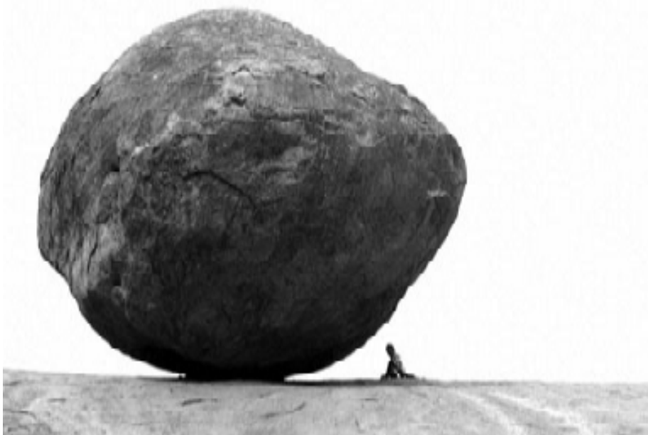
Huge 'Krishna Butter Ball' Stone Boulder At Mahabalipuram

The entire town is divided into 2 sections, the French Quarter (Ville Blanche) and the Indian Quarter (Ville Noire) . Many streets still retain their French names. Pondy has a great collection of boutique hotels such as The Hotel De'LOrient that serve excellent French Creole cuisine.