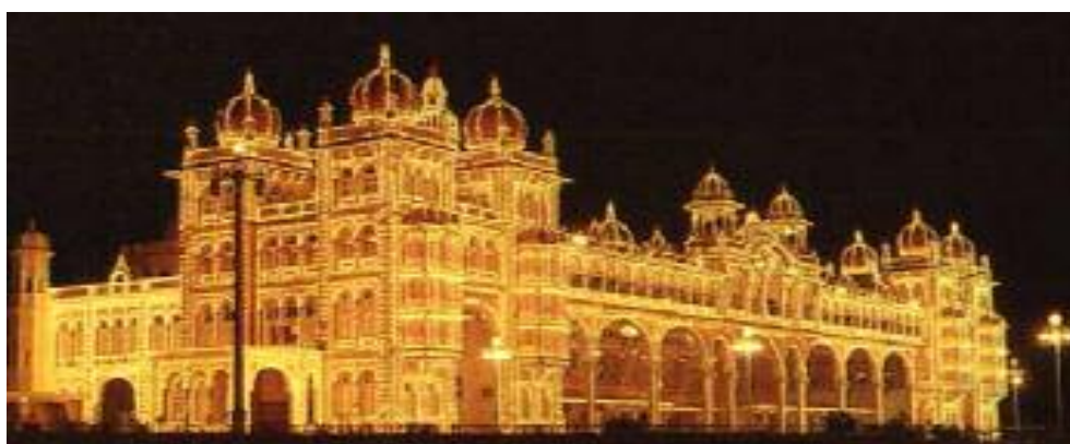
The Mysore Palace.