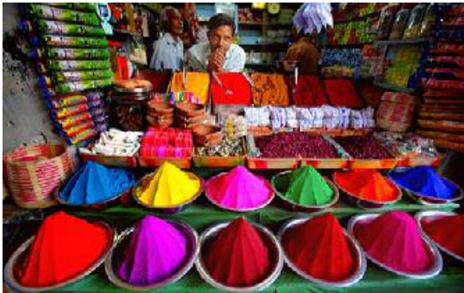
Spice Market Stall At Mysore

Mysore is replete with memories of the legendary warrior Tippu Sultan who fought wars with the British at the end of the 18 th Century. Tipu Sultan's Fort at Srirangapatnam with double wall defences was considered the second strongest in India . Located just outside the fort is Tipu Sultan's Wooden Summer Palace with ornate and beautiful frescoes. At The Gumbaz lie the tombs of Tipu Sultan and his father Hyder Ali .