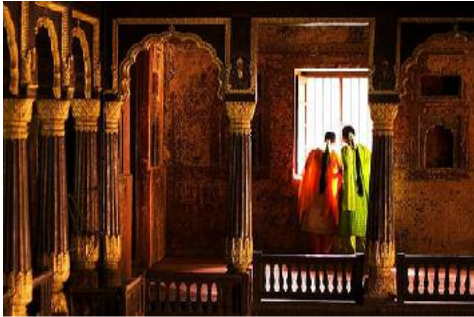
Tipu Sultan's Palace At Bangalore