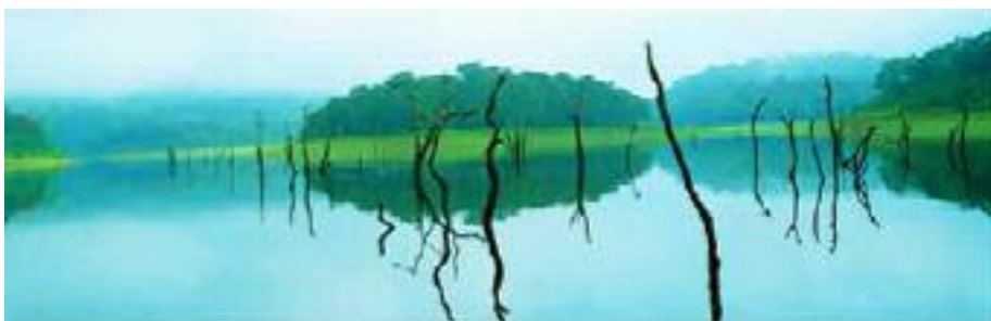
Reflections At Periyar Lake Wildlife Sanctuary