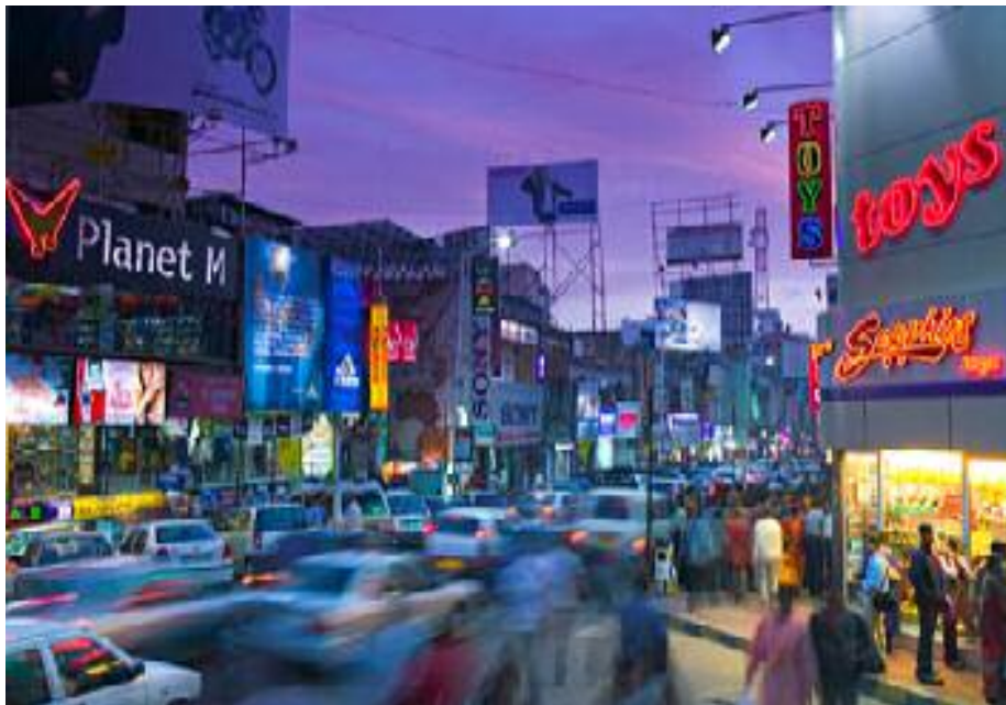
Brigade Road In Central Bangalore

Capital of the southern state of Karnataka , Bangalore today is Asia's fastest growing cosmopolitan city. It is home to some of the most high tech industries in India . Blessed with a salubrious climate, gardens and parks, shopping malls and the best restaurants and pubs in this part of the globe. Bangalore is the ideal gateway to India and beyond.