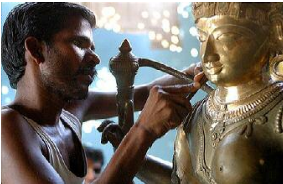
Bronze Casting At Tanjore

The Royal Palace At Thanjavur was built partly by the Nayaks around 1550 AD. It is possible to climb the Godagopuram , an eight storey watchtower and armoury of 190 feet high. The museum's galleries contain a World Famous Collection Of Magnificent Tanjore Bronzes depicting ancient themes, dancers and deities.