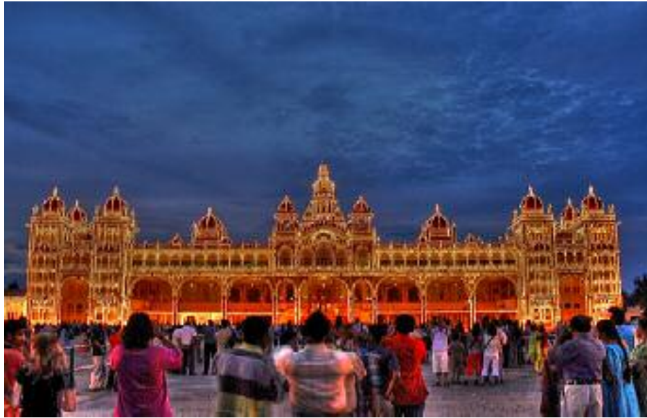
The Extravagant City Palace At Mysore