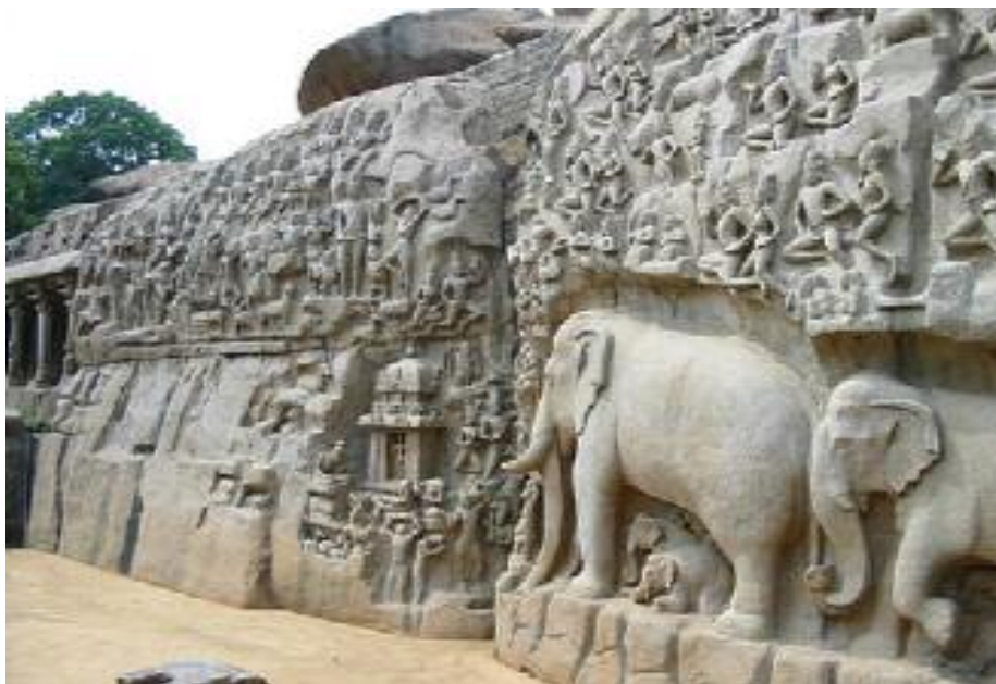
The Famous Arjuna's Penance Bas Relief

The scenic Shore Temple , The Five Rathas (chariots) made from single stone boulders and Arjuna's Penance , the largest bas-relief in the world are highlights. The entire city resonates to the sound of chisels from small workshops that produce very ornate stone sculptures.