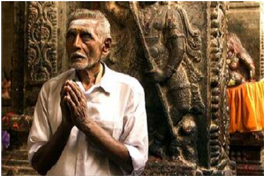
A Devotee At Sri Meenakshi Temple

Also worth visiting is The Thirumalai Nayakar's Palace (1623), a classic example of the Indo-Saracenic style of extravagant architecture. Madurai is famous for Jasmine flower sellers and spice markets that crowd the narrow streets around the main temple complex