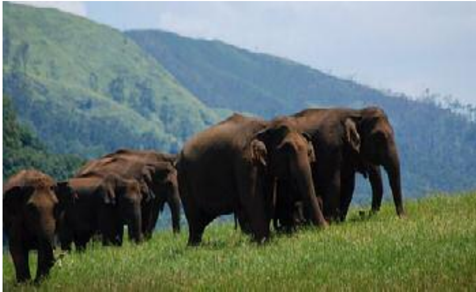
Wild Elephants At Periyar Lake Wildlife Reserve