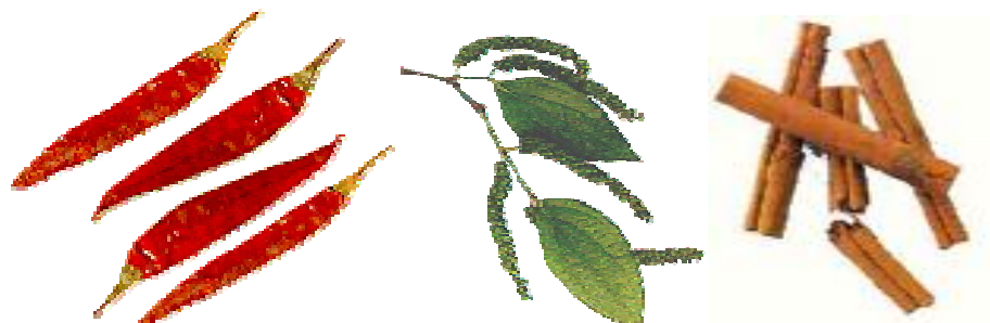
Chilli, Black Pepper And Cinnamon

Thekkady is the centre of the spice growing area of Kerala , and the aromas of spices are everywhere. Numerous Spice Plantation Villages have guided tours to identify various spice plants and even cookery demos using spices. At Kumily Market there is a huge cardamom auction and shops selling different types of spices.