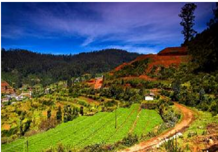
Colours Of The Nilgiri Hills

Coonoor is the second largest hill station in the Nilgiris , surrounded by tea plantations. Its climate is milder than Ooty and the weather remains pleasantly cool throughout the year.