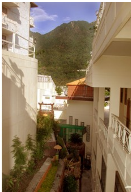
View From Bedroom