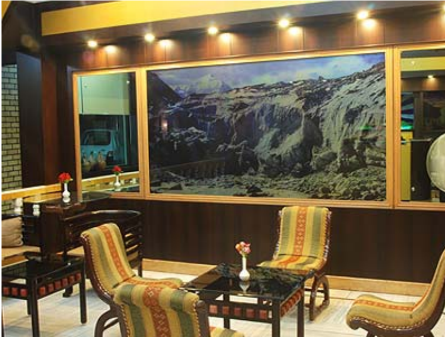
Lobby Of Hotel Great Ganga