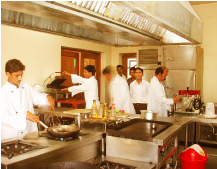
Kitchen At Great Ganga

The internationally famous Aarti Ceremony that is performed every evening can be witnessed from the roof top of the hotel. Another highlight is the nearby forest which is a most appropriate experience for a nature walk.