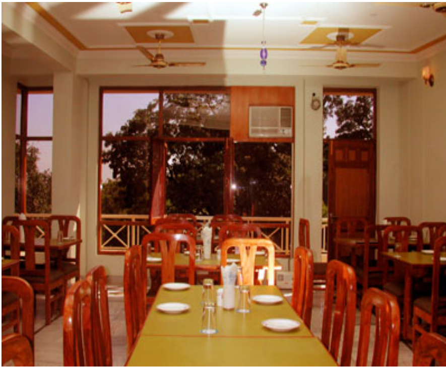
Machan Restaurant At Great Ganga