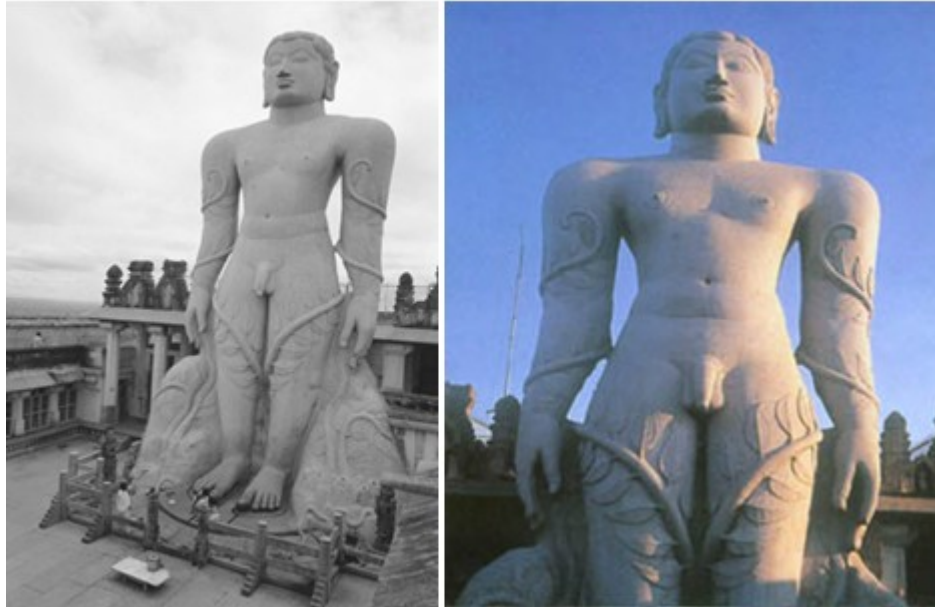
Statue Of The Jain Saint Gommateshwara