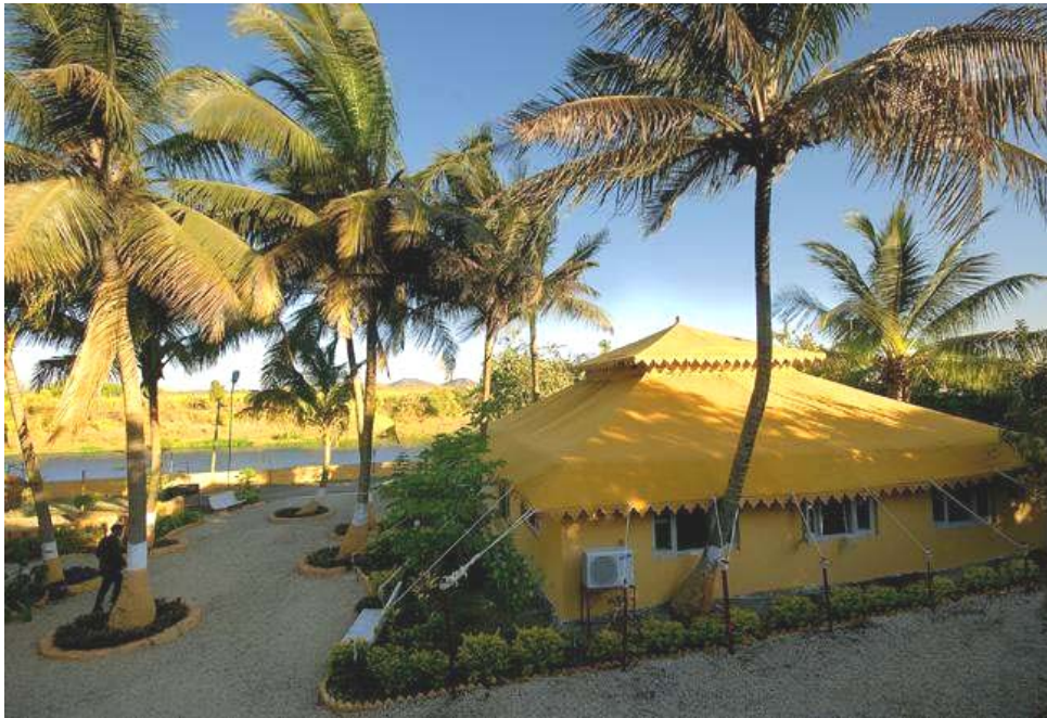
Lion Safari Camp At Sasan Gir