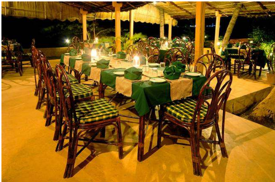
Dining At Lion Safari Camp