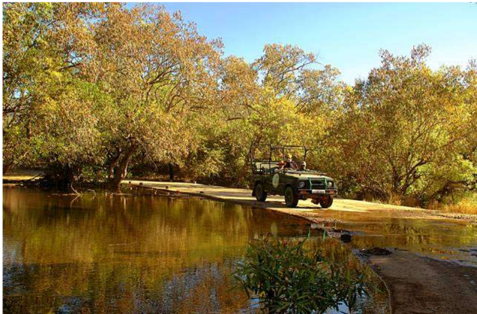
Beautiful Jungle At Sasan Gir

Fresh seafood can be arranged on a days advance notice. The chef makes his special mango pickle and other dishes made from mango during the mango season. Picnic lunch or tea can also be arranged at the nearby scenic locations.