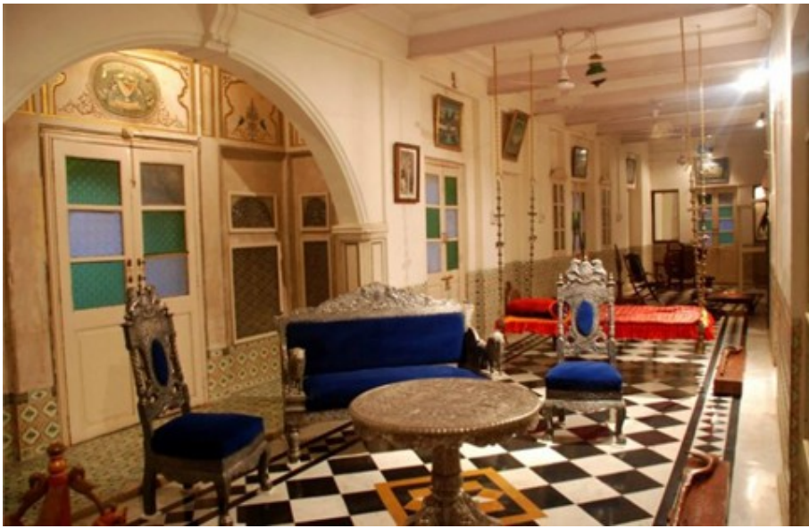
Interior Of Mandir Palace