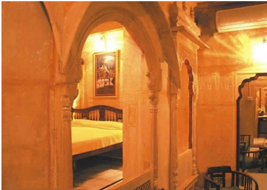
The Golden Suite (1774)

Hotel Mandir Palace is a beautiful heritage hotel, about two centuries old, built in traditional haveli style. The most outstanding feature of the hotel is the tower known as " Badal Vilas " which is more than 50 meters high and is an important landmark of the Jaisalmer city.