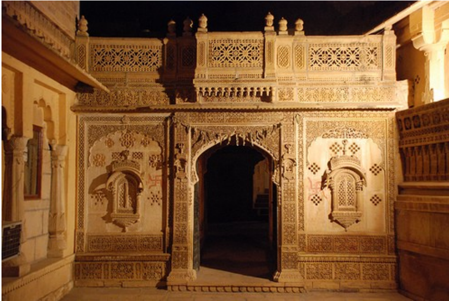
Exquisite Stonework At Mandir Palace

The hotel houses a multi cuisine Palace Restaurant that specializes in an enchanting variety of Indian, Continental, Chinese and Rajasthani culinary preparations. It also features a coffee shop and bar for refreshments. You may also dine in the exquisite courtyard or the Rooftop Restaurant with panoramic views of the fort.