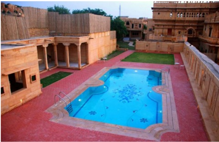
Pool At Mandir Palace

Outside Jaisalmer , there are more beautiful sights of honeyed stone, including Gadsisar Lake , with its temples and gateways. Sam Dunes are the nearest impressive sand dunes, where you can go for a sunset camel ride.