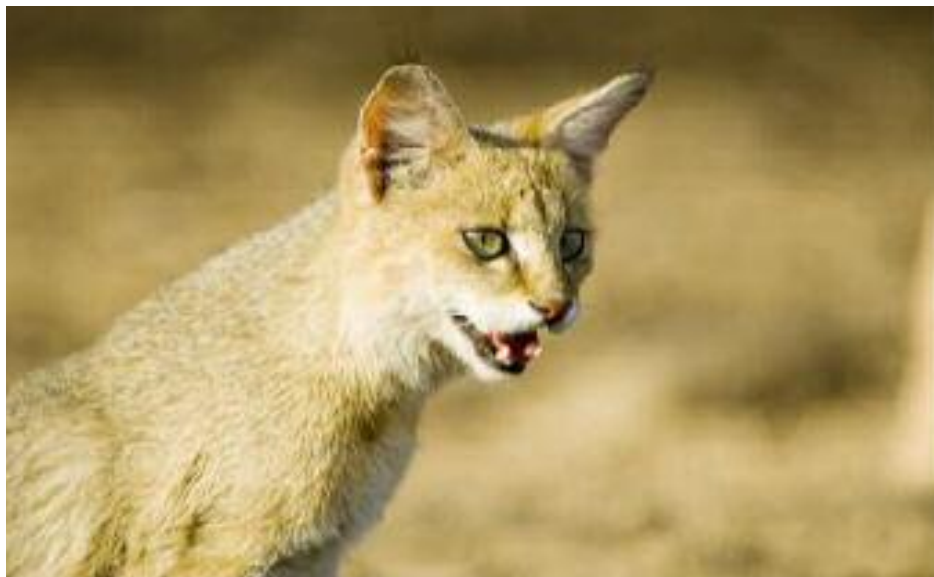
Indian Wild Cat At Ranthambhore