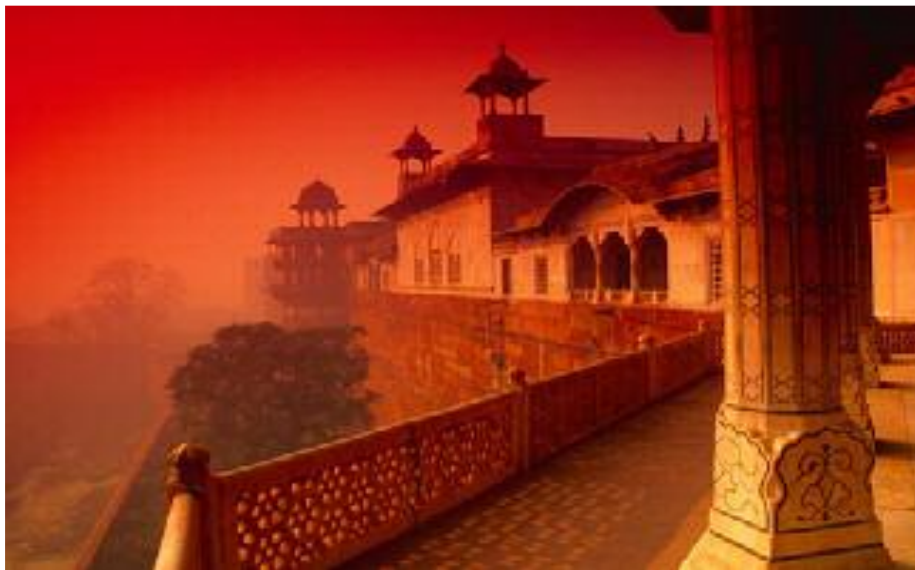
Dawn Over The Red Fort Of Agra

The powerful fortress of red sandstone encompasses, within its 1.5 mile-long enclosure walls, many fairytale palaces such as the Jahangir Palace and the Khas Mahal , audience halls such as the Diwan-i-Khas , and Sheesh Mahal (The Glass Palace) which is inlaid with thousands of mirrors and was once the harem's dressing room.