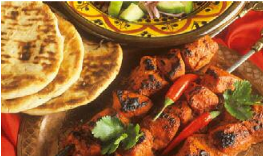
Delicious Delhi Cuisine

From the labyrinthine streets of Old Delhi , emerge in to the wide open spaces of imperial New Delhi , with its ordered governmental vistas and generous leafy avenues. Those with an appreciation for colonial architecture will marvel at Sir Edwin Lutyen's buildings such as Viceroy's House (Rashtrapati Bhavan) , Parliament House and the India Gate , one of Delhi's most famous landmarks. Rajghat , the cremation site of Mahatma Gandhi is also a popular place for visitors.