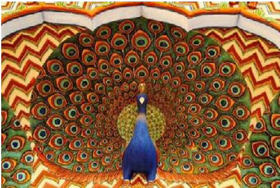
Peacock Gate At Jaipur

The Palace Of The Winds (Hawa Mahal) is Jaipur's most acclaimed attraction. Built in 1799, overlooking one of the city's main streets to offer the women of the court a vantage point, behind stone-carved screens, from which to watch the activity in the bazaars below.