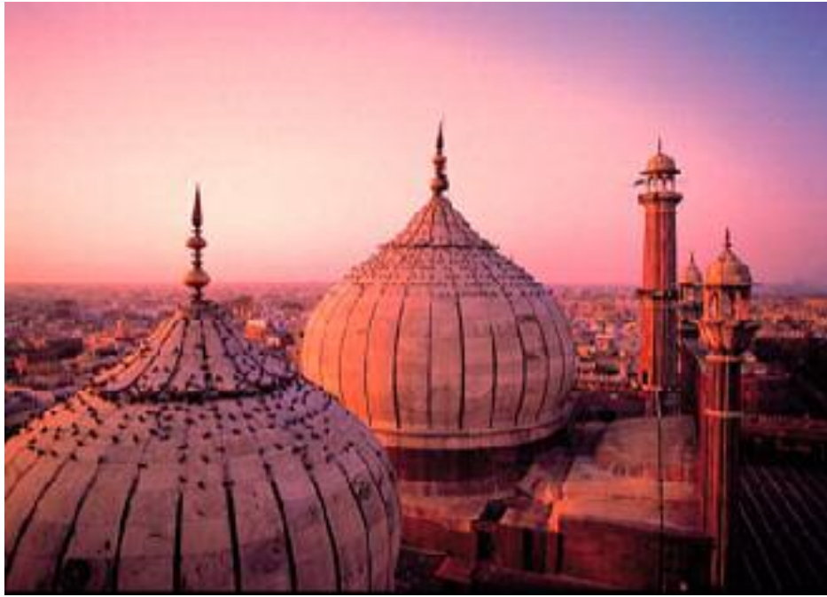
Towers Of The Jama Masjid