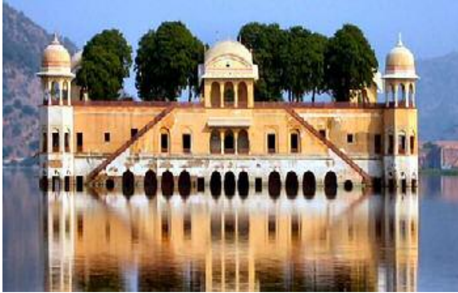
The Jal Mahal Palace At Jaipur