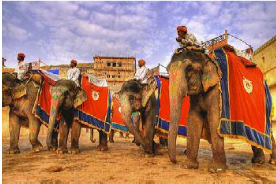
Elephants At Amber Fort