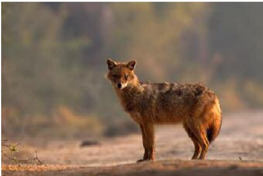
Indian Jackal At Bharatpur

Bharatpur is also an excellent place to watch mammals like Golden Jackal , Striped Hyaena , Fishing Cat , Jungle Cat , Nilgai , Sambar , Blackbuck and Wild Boar .