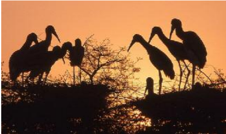
Keoladeo Heronry At Bharatpur