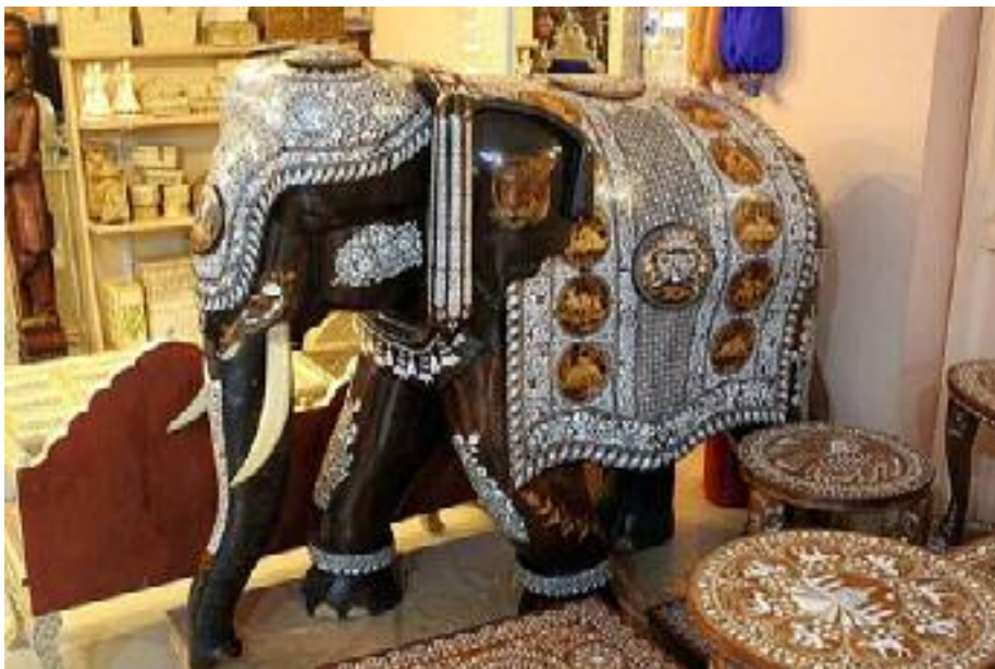
Indian Crafts At Delhi Emporium

Other Delhi highlights include the Bahá'í Lotus Temple , shaped like a lotus bud with 27 petals, suspended above milky-blue ponds. The Swaminarayan Akshardham Temple , is a large and elaborate temple carved of red sandstone. The central monument houses an 11-ft golden statue of the founder of the Swaminarayan faith, Bhagwan Swaminarayan .