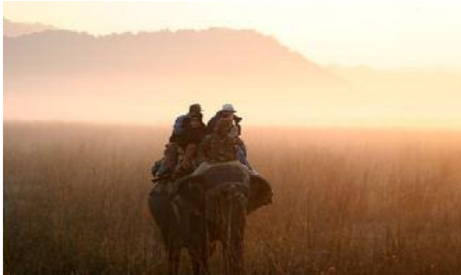
Safari On Elephant Back At Corbett