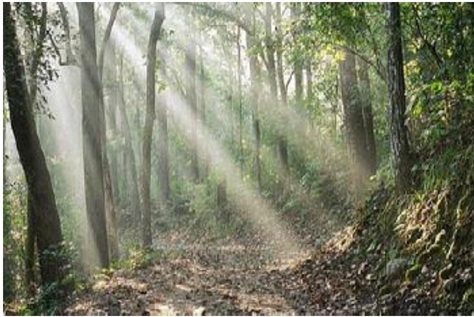
Corbett's Beautiful Jungles