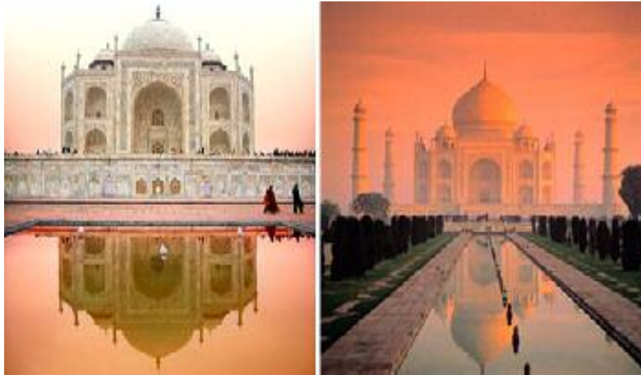
Views Of The Taj Mahal