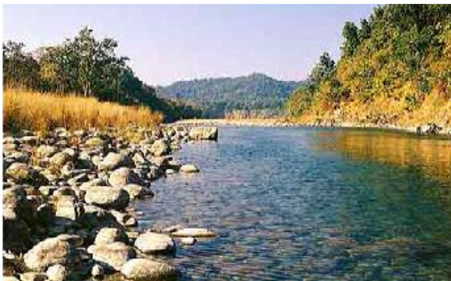
The Ramganga River At Corbett National Park

Wildlife viewing is by Open-Topped Jeep and on Elephant-Back , which is a treat in itself, as they are surprisingly graceful and quiet when trekking through the brush.