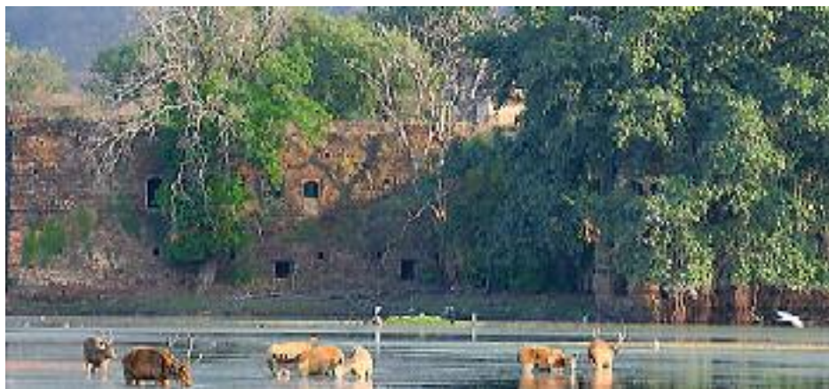
The Old Fort At Ranthambhore