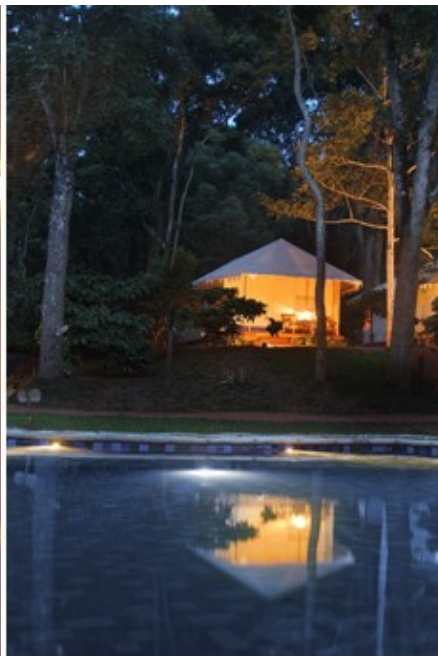
Orange County Pool Villa And Luxury Tented Camp