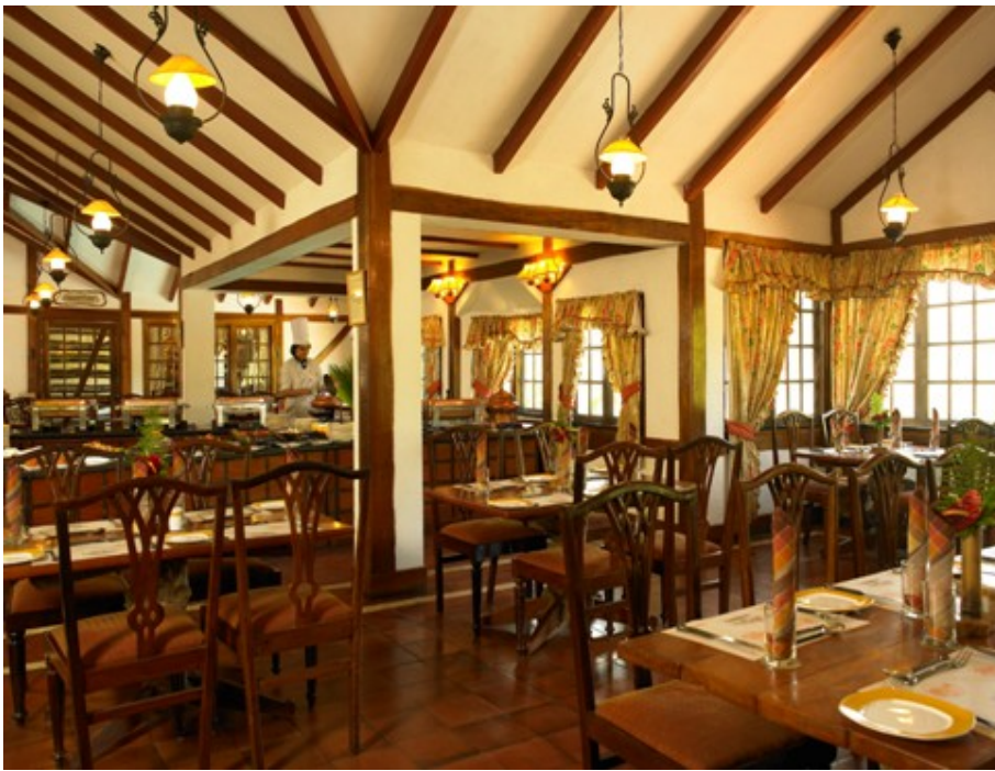
The Granary Restaurant