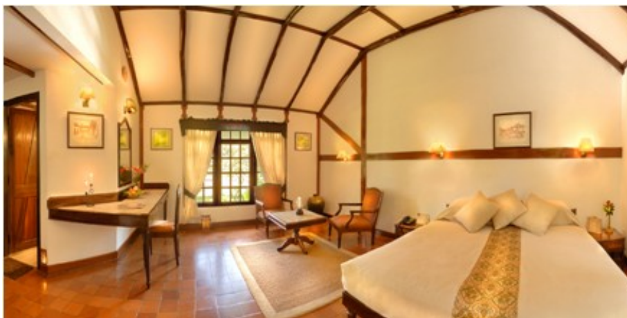
Interior Of County Cottage

Nestled in the Western Ghats , perched at 800 meters above sea level and set amidst 300 acres of coffee and spice plantations, is Orange County - one of India's finest holiday resorts. Beautiful timber-framed thatched cottages are set among pathways lined with huge trees and spice plants such as cardamom, pepper, nutmeg and cloves. All of this is combined with outstanding customer service and exceptional attention to detail, as well as marvelous Indian cuisine at its restaurants.