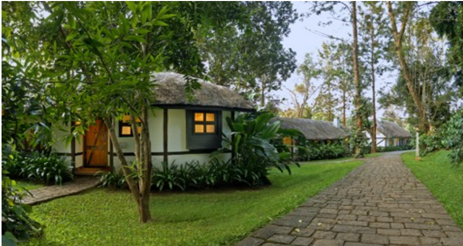
Beautiful Cottages At Orange County