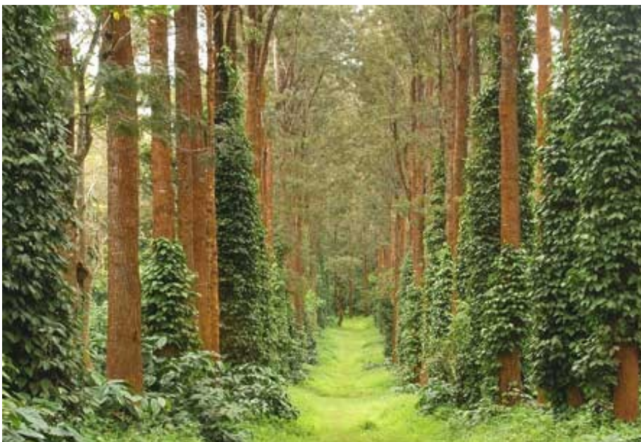
Orange County Spice Plantation

There is a fine multi cuisine restaurant called The Granary , and the Pepper Corn which serves up kebabs and sizzlers. People who are pure vegetarians, have Plantain Leaf , an exclusive vegetarian restaurant. Hunters Lodge is a rustic bar with trophies on the walls.