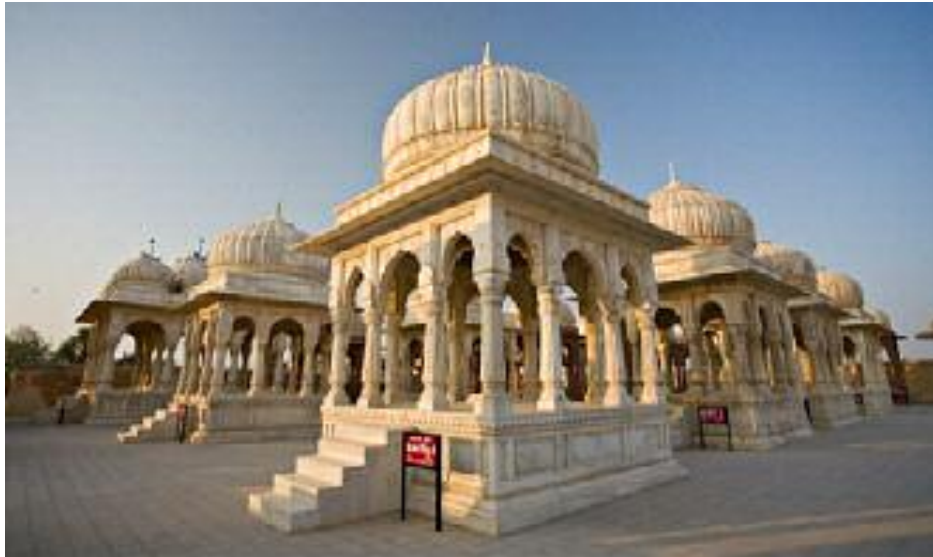
Bikaner Royal Cenotaphs