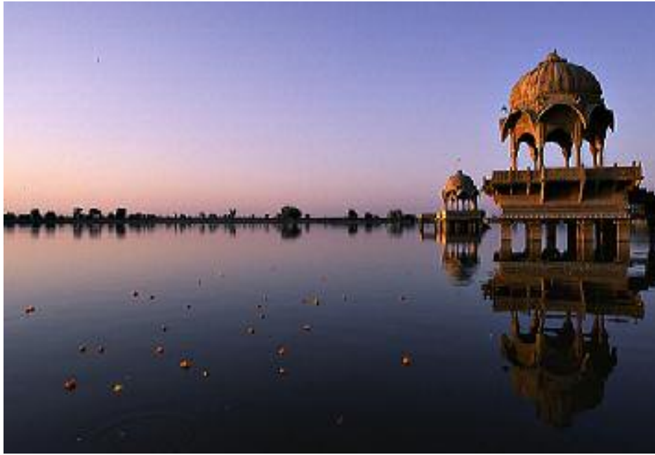
Gadisar Lake Near Jaisalmer