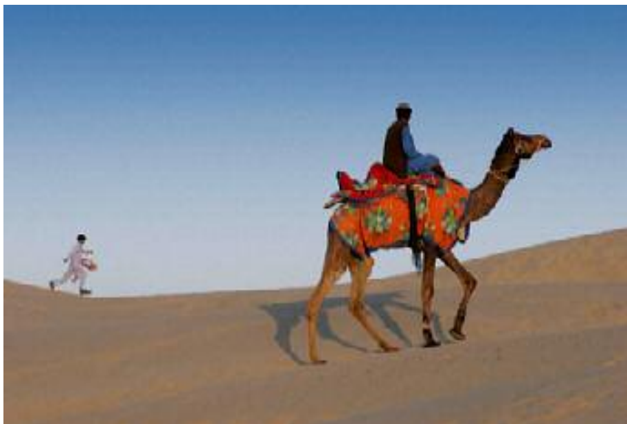
Camels At Jaisalmer

Sam Sand Dunes are on the edge of the Desert National Park . A magical place, especially at sunrise or sunset where it is possible to take Camel Rides into the lonely shifting sand dunes of the Thar Desert .