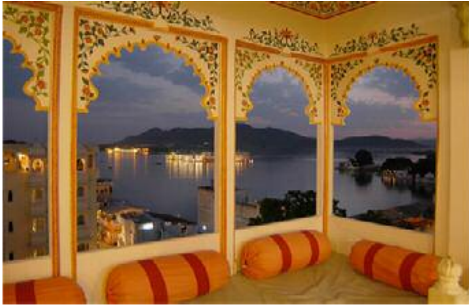
Night View Of Udaipur And Lake Pichola