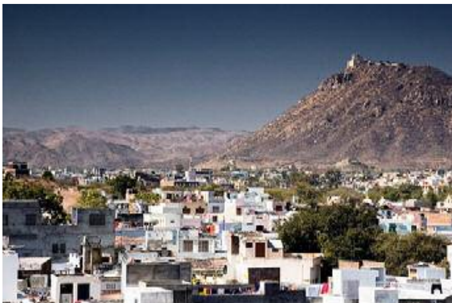
The Monsoon Palace Above Udaipur

The view of Udaipur from the Monsoon Palace is not to be missed. It is located high up on a peak in a forest covered wildlife sanctuary just outside the city.