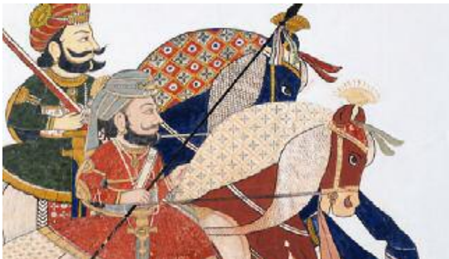
Detail Of Fresco At Shekhawati

The semi-desert region of Shekhawati is famous for a fine collection of painted Havelis , or splendidly frescoed mansions that were constructed by prosperous Rajasthani merchants. You can take an afternoon walk around some of its villages and admire their richly decorated exteriors and interiors. The best is the wonderful Podar Haveli in the village of Nawalgarh .