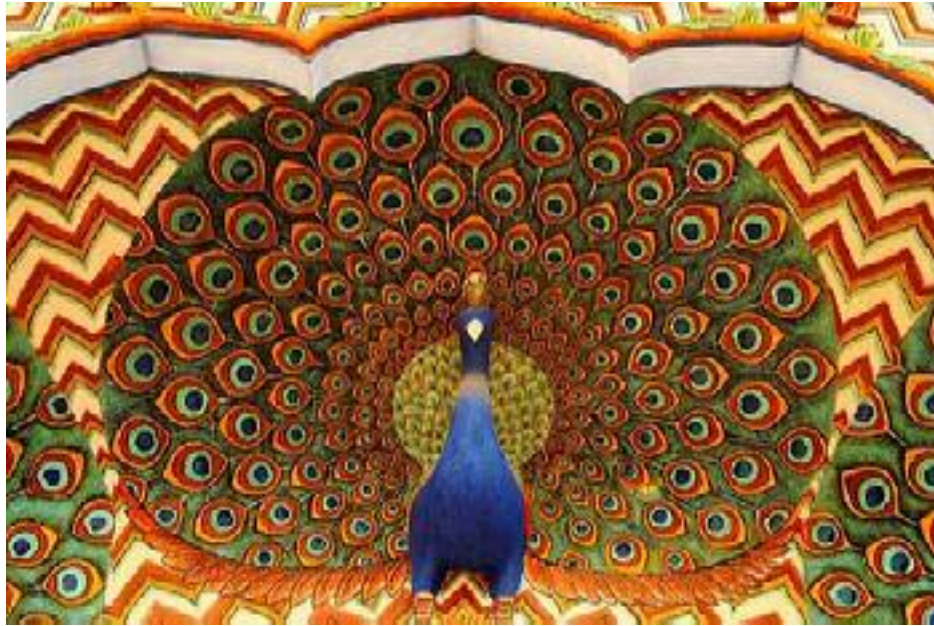
Peacock Gate At Jaipur