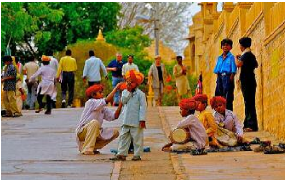
Inside Jaisalmer Fort

The Manak Chowk is the main marketplace outside the fort where one can walk through lanes where the famous Carved Havelis Of Jaisalmer can be found.