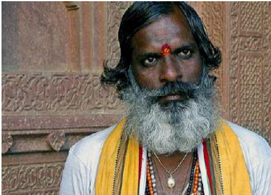
Holy Man At Fatehpur Sikri

The deserted city of Fatehpur Sikri was the capital of Emperor Akbar between 1570 and 1585. Due to a severe shortage of water the city was abandoned after only fifteen years and the capital was relocated back to Agra . As a result Fatehpur Sikri stands untouched and perfectly preserved, a complete medieval fortress of red sandstone, with vast central squares, exquisitely carved multi-tiered pavilions, cool terraces and formal gardens.