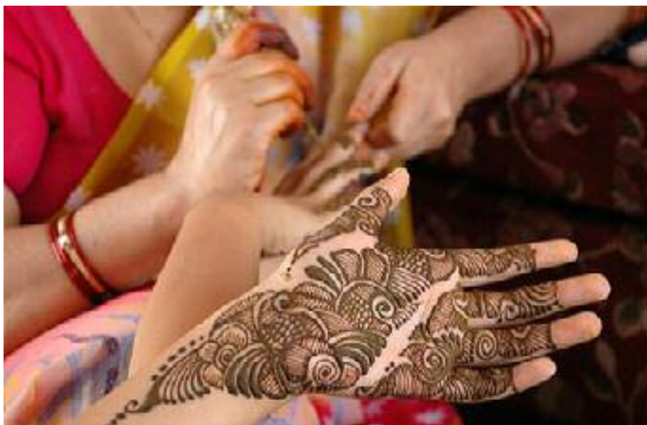
Mehendi Hand Painting At Jodhpur

Near Jodhpur , the Bishnois are a simple village community who are strong lovers of wild animals. Their passion for protecting trees and wildlife has led to many tales of members of this community sacrificing their lives in order to protect their environment. If interested, you can visit their villages and buy beautiful home made rugs and handicrafts.