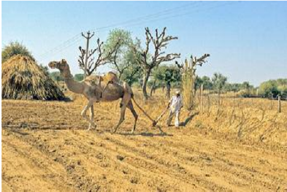
Farm At Shekhawati