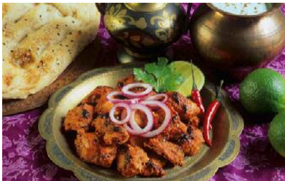
Delicious Delhi Cuisine

Humayun's Tomb is one of Delhi's three UNESCO World Heritage Sites . The tomb is located in large, immaculately maintained gardens. The Qutub Minar (1193 AD) is the tallest brick minaret in the world (238 ft) and an architectural wonder of India .