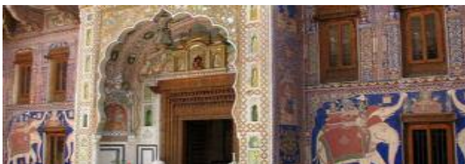
Haveli At Mandawa