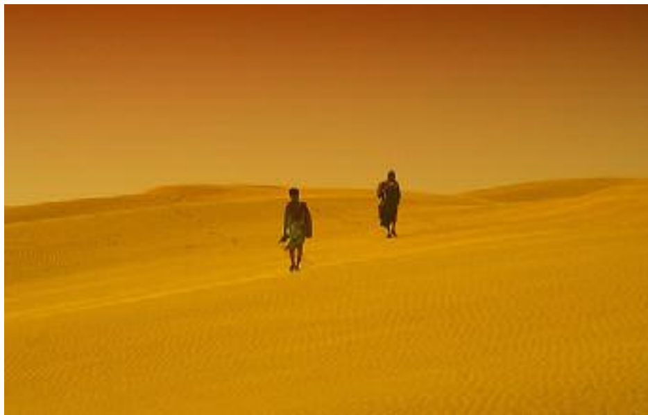
Nomads At Sam Dunes Near Jaisalmer