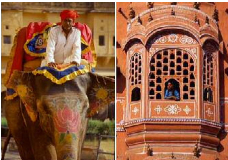
On Elephant Back To Amber Fort And Window Of The Hawa Mahal

Amber is situated about 7 miles from Jaipur and was the ancient citadel of the ruling clan of Amber . The Amber Fort (1592) set in picturesque and rugged hills is a fascinating blend of Hindu and Mughal architecture. The forbidding exterior belies an inner paradise with a beautiful fusion of art and architecture. You have the added attraction of an Elephant Back Ride to ascend to the top.