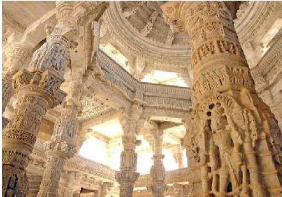
Amazing Interior Of Ranakpur Jain Temple