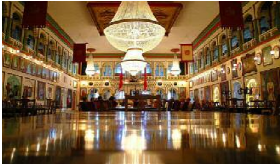
Durbar Hall At Fateh Prakash Palace