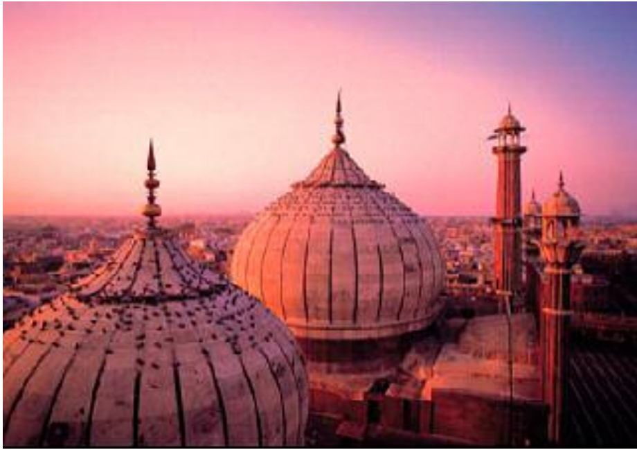
Towers Of The Jama Masjid