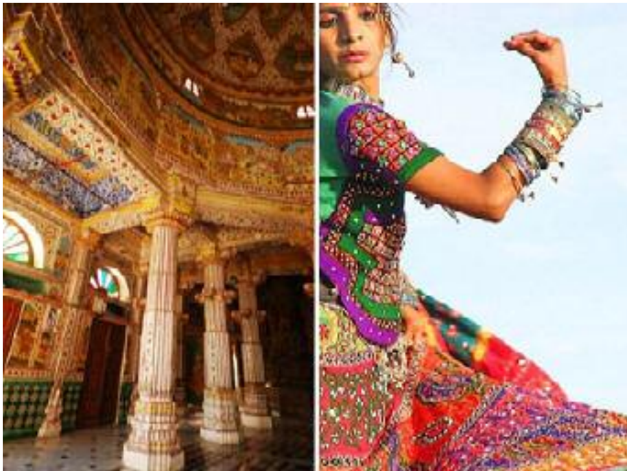
Junagarh Fort And Rajasthani Dancer

The palaces within the fort make a picturesque ensemble of courtyards, balconies, kiosks, towers and windows. A major feature of its fort and palaces is the superb quality of stone carving.