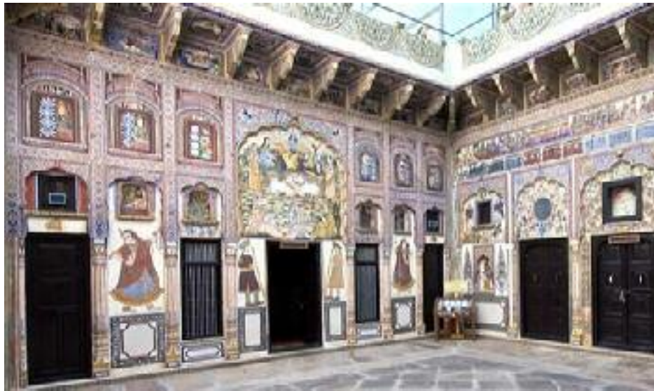
Interior Of Podar Haveli