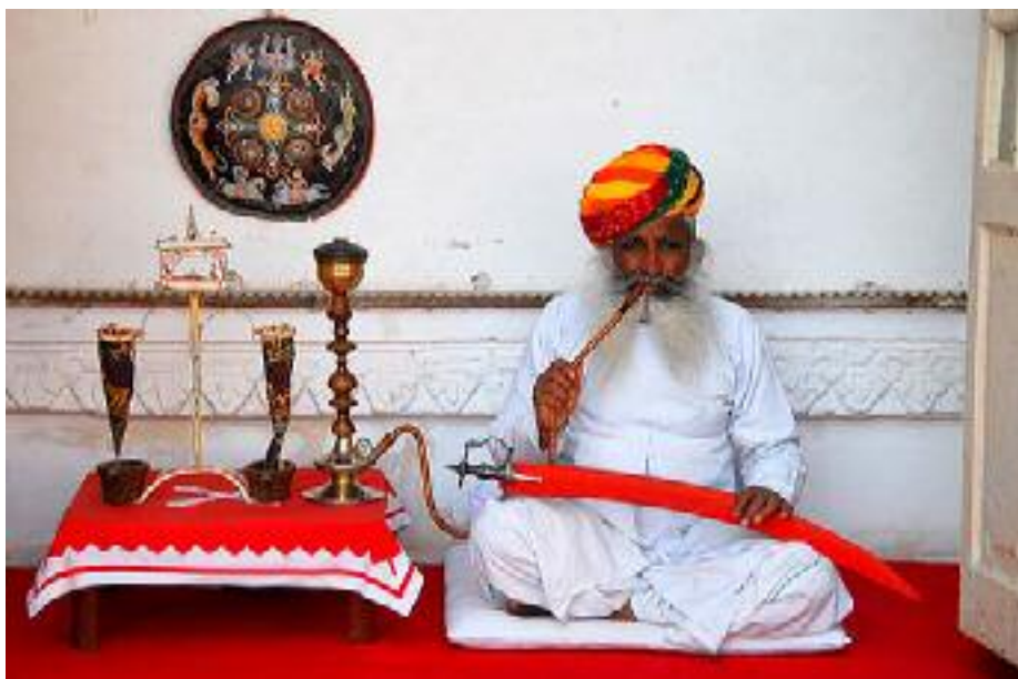
Retainer Inside Mehrangarh Fort

Umaid Bhawan Palace (1929) is a beautiful edifice of marble and pink sandstone. This immense palace is also known as the Chittar Palace and is now a grand and extravagant heritage hotel that is one of the most luxurious in princely India .