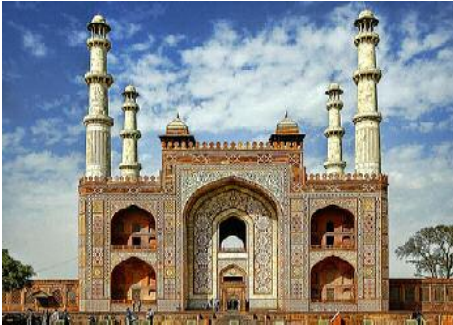
Emperor Akbar's Mausoleum At Sikandra