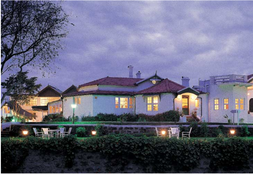
Taj Gateway Coonoor