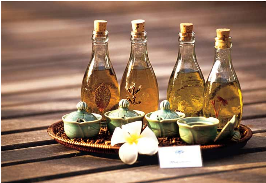
Spa At Taj Gateway Coonoor

Coonoor provides the traveller with the panoramic view of the lush green Nilgiri Hills , with its ravines, valleys, and waterfalls. Bird watching is a popular pastime in Coonoor , as the area boasts of a large variety of species like Cormorants, Pipits, Thrushes, Parakeets, Skylarks, and Nilgiri Verditer . It is possible to take a walk through the lush tea gardens. There are a number of trekking and hiking trails around Coonoor .