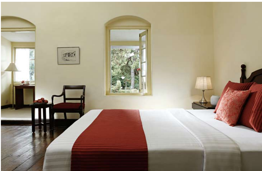
Taj Gateway Coonoor Bedroom

The suites are tastefully decorated cottage style rooms with ethnic colonial architecture along with a very spacious sitting, living, dressing and bed room.