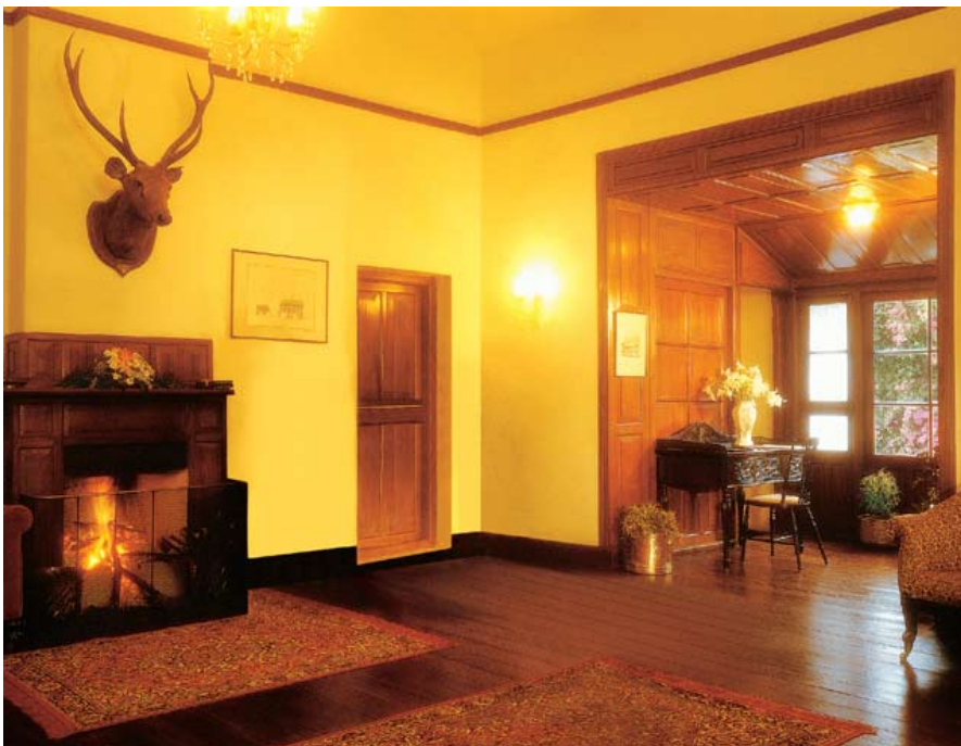
Taj Gateway Coonoor Lounge

Nestled In the heart of rolling mountains and drifting mists, guests at the hotel find it easy to lose themselves in the beauty of soothing views, exotic surroundings and the old world charm. at this historic hotel. An artful blend of colonial architecture and contemporary amenities ensures that guests will find their stay here to be a relaxing experience.