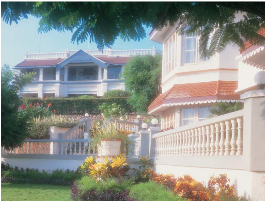
Taj Gateway Madurai

Located on the banks of Vaigai River , Madurai is the second largest city in Tamil Nadu . It has been an important religious and commercial center for thousands of years. The 2000 year-old Sri Meenakshi Temple complex is literally a city within the city of Madurai , one of the largest of its kind in India and undoubtedly one of the oldest too. It enshrines Lord Siva and his wife, Meenakshi .