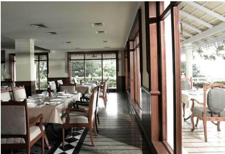
The View Restaurant At Taj Gateway Madurai