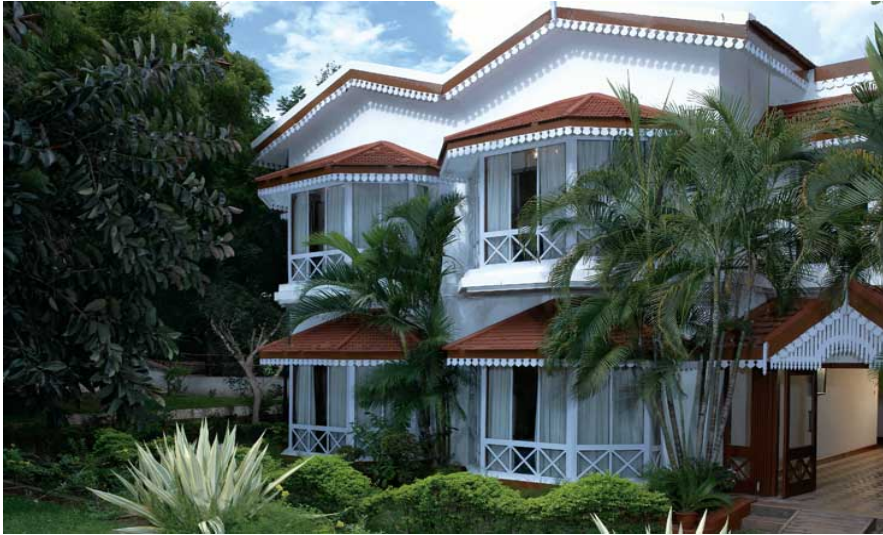
Taj Gateway Madurai