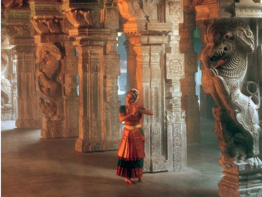
The Sri Meenakshi Temple

Delicious food options from the Chettinad District are available here and should not be missed. Various filled pancake-like snacks are a specialty. Visitors enjoy delicacies like Appam and Idiyappam . Dosa , Idli , Sambar and Rasam are popular snacks mainly eaten at breakfast. Kal Dosai , a special variety of dosai from the southern districts of Tamil Nadu is another unique dish.