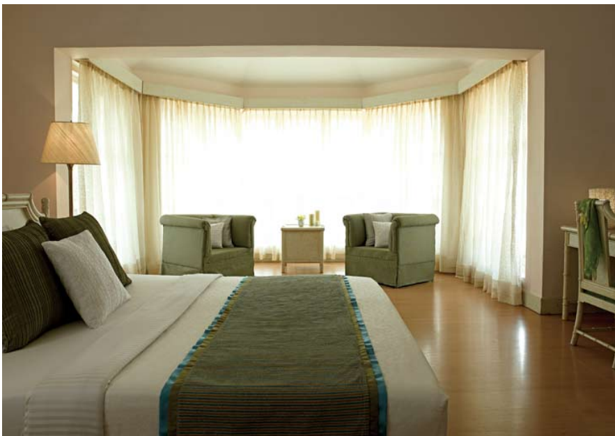
Bedroom At Taj Gateway Madurai

Deluxe Rooms are spacious and luxurious, these rooms feature bay windows, offering breathtaking views of the Meenakshi Temple's towers and the Kodai Hills .