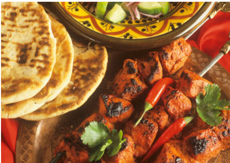
Delicious Delhi Cuisine

Humayun's Tomb is one of Delhi's three UNESCO World Heritage Sites . The tomb is located in large, immaculately maintained gardens in the Persian Char Bagh (four corners) style that have been thoroughly renovated and are consequently probably the best in Delhi .