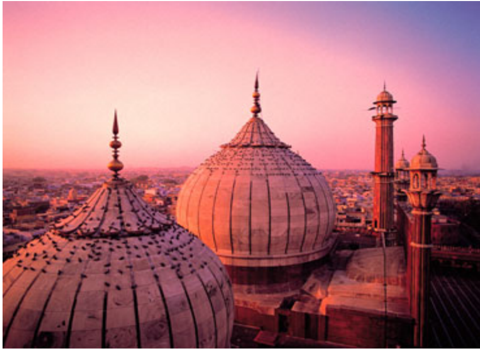
Domes Of The Jama Masjid