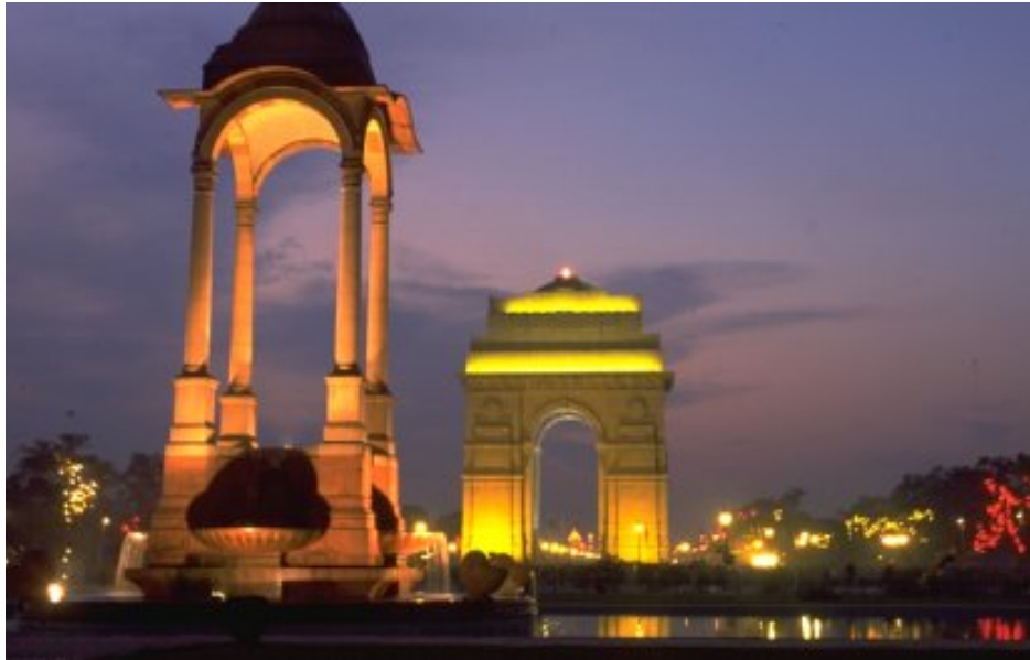
India Gate At Rajpath