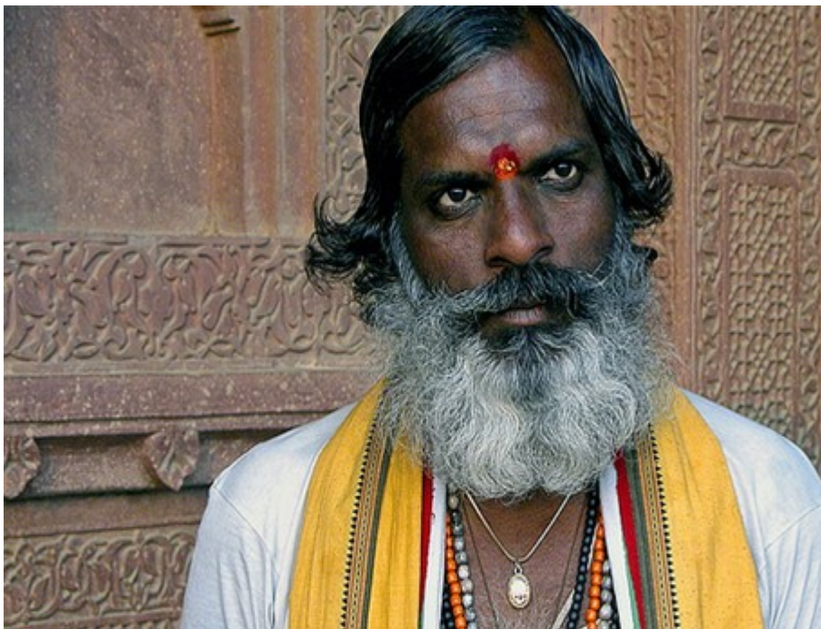
Holy Man At Fatehpur Sikri

The deserted city of Fatehpur Sikri was the capital of the Emperor Akbar between 1570 and 1585. Due to a severe shortage of water the city was abandoned after only fifteen years and the capital was relocated back to Agra . As a result Fatehpur Sikri stands untouched and perfectly preserved, a complete medieval fortress of red sandstone, with vast central squares, exquisitely carved multi-tiered pavilions, cool terraces and formal gardens.