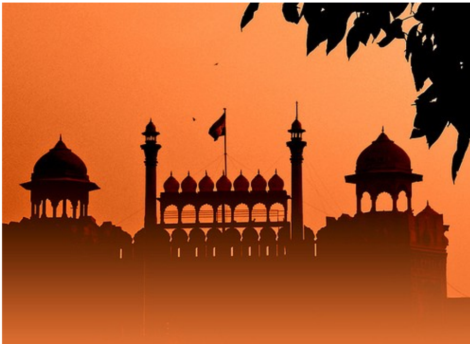
The Red Fort At Delhi

The Red Fort Of Delhi (Lal Qila) was the palace of Mughal Emperor Shah Jahan and dominates the old city. The Jama Masjid is a mosque of vast proportions with a courtyard that can easily accommodate 25 000 people.