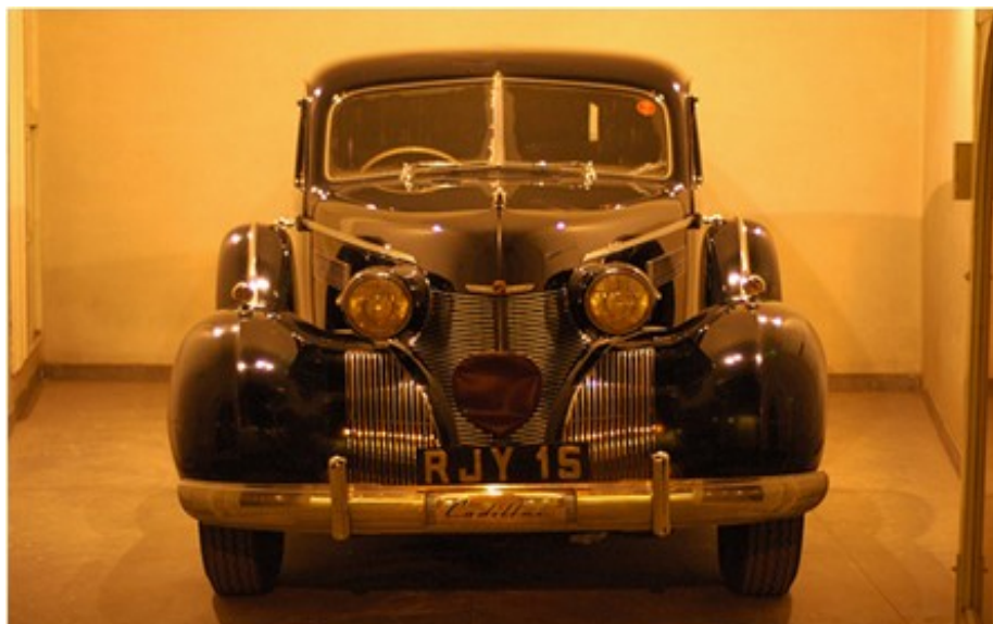
Maharajah's Car Collection

The fine Jagdish Temple is an Indo-Aryan temple dating from 1651 is the largest and most splendid temple of Udaipur .