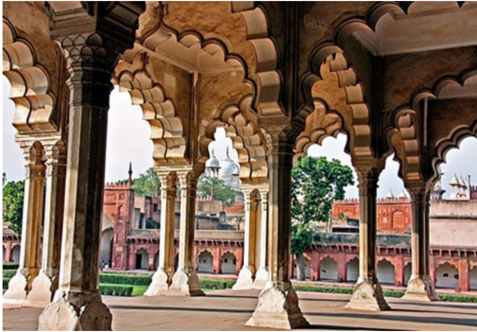
Audience Hall At The Red Fort Of Agra