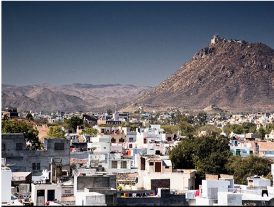
The Monsoon Palace On A Peak Above Udaipur