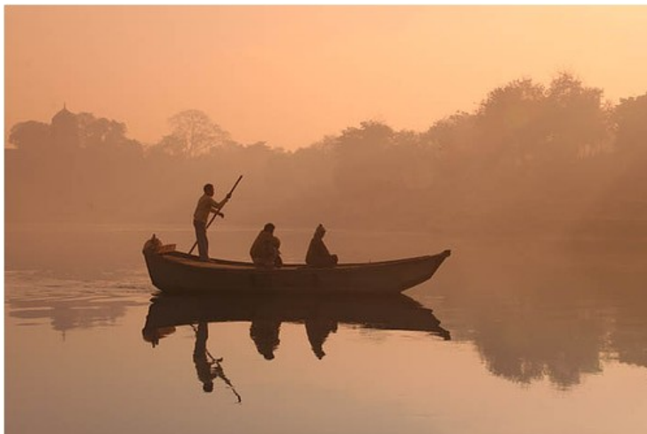
Dawn On The River Yamuna At Agra

The powerful fortress of red sandstone encompasses, within its 1.5 mile-long enclosure walls, many fairytale palaces such as the Jahangir Palace and the Khas Mahal , audience halls such as the Diwan-i-Khas , and Sheesh Mahal (The Glass Palace) which is inlaid with thousands of mirrors and was once the harem's dressing room.