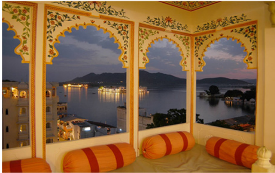
Lake Pichola At Night