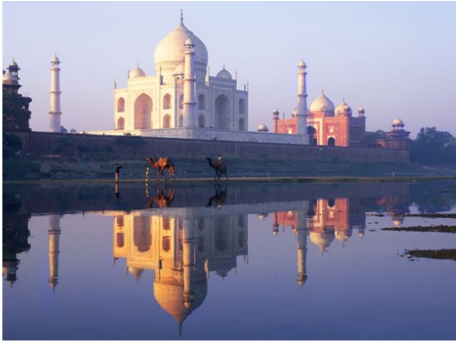
The Beautiful Taj Mahal At Agra