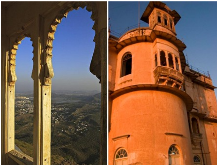
The Monsoon Palace

Sajjangarh Wildlife Sanctuary has been established on the thickly wooded hillside which the former rulers maintained as a royal shooting preserve. The palace has high turrets and guards regulating each of the towers. The palace overlooks the Indian jungle which is inhabited by wild animals including Indian Tigers .