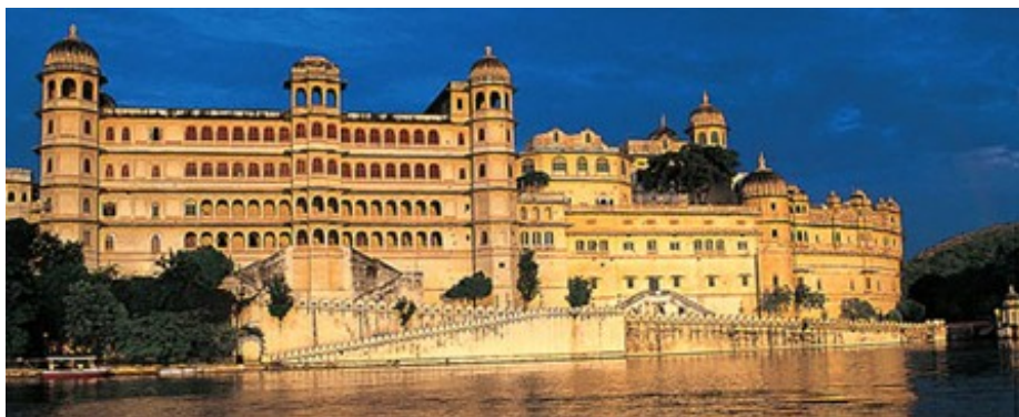
The City Palace At Udaipur

Every evening, the grounds of the magnificent Manek Chowk inside City Palace, Udaipur , come alive in a blaze of lights, as the sound and light show gets underway. The hour-long show seeks to recreate Mewar's glorious history in a delightful play of light and sound, as a narrative in English evokes significant episodes in the eventful centuries of the region's history.