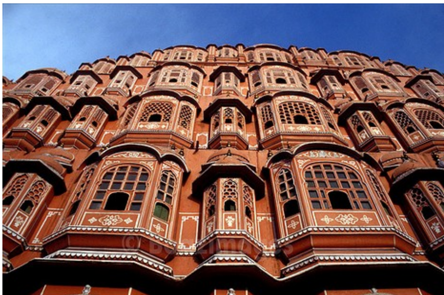
The Palace Of Winds

Amber is situated about 7 miles from Jaipur and was the ancient citadel of the ruling clan of Amber . The Amber Fort (1592) set in picturesque and rugged hills is a fascinating blend of Hindu and Mughal architecture. The forbidding exterior belies an inner paradise with a beautiful fusion of art and architecture. You have the added attraction of an Elephant Back Ride to ascend to the top.