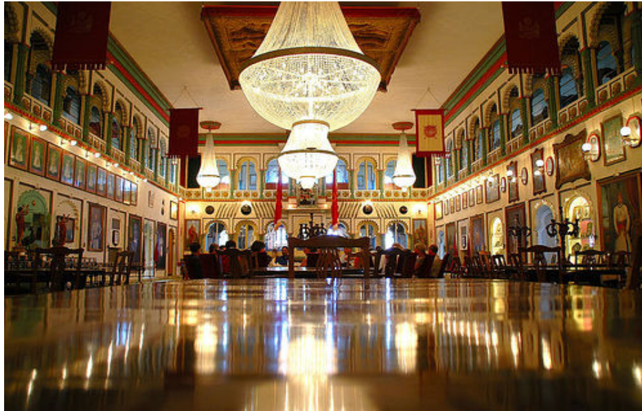
Durbar Hall At Fateh Prakash Palace