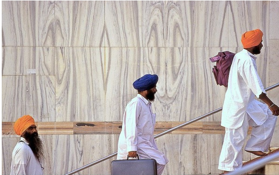
Sikh Temple At New Delhi