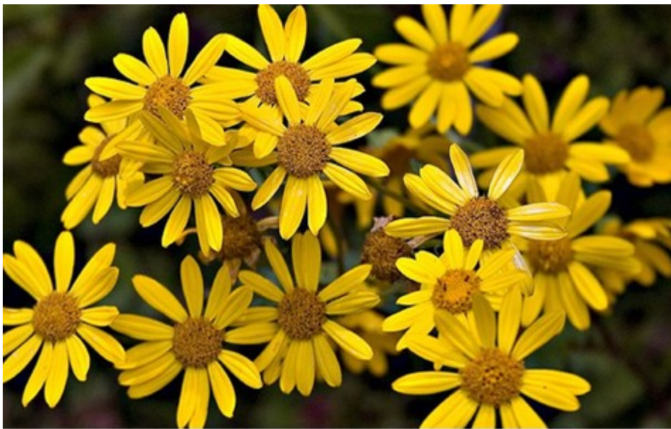
Flowers Along The Path To The Valley

Ghangaria is a small village by the side of the Lakshman River which acts as a base camp for people going to The Valley of Flowers and Sikh pilgrims travelling to the holy lake at Hemkund . A stopover night is required at Ghangaria .