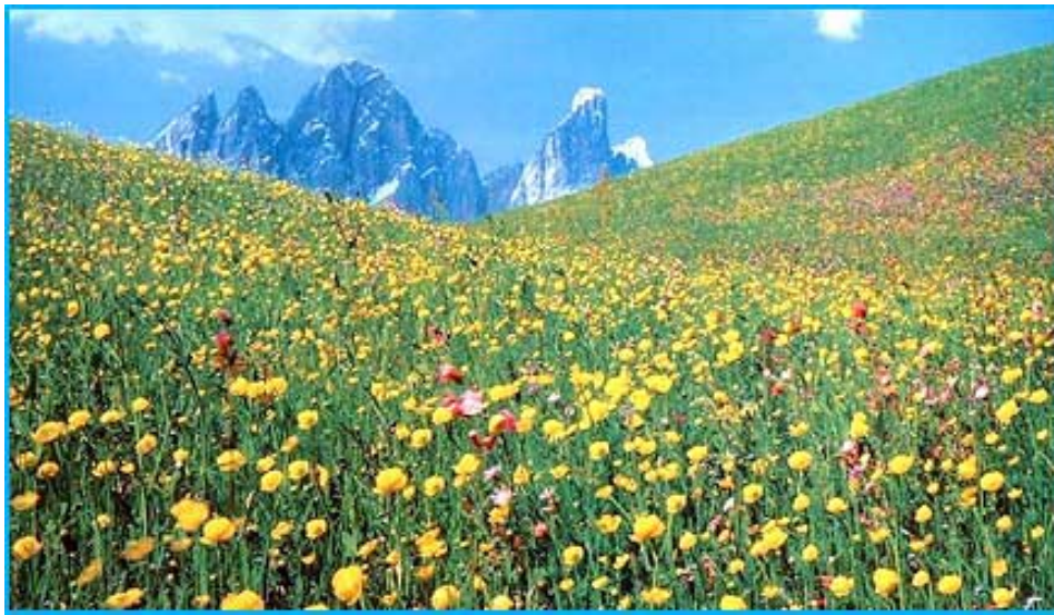
Valley Of Flowers In Bloom