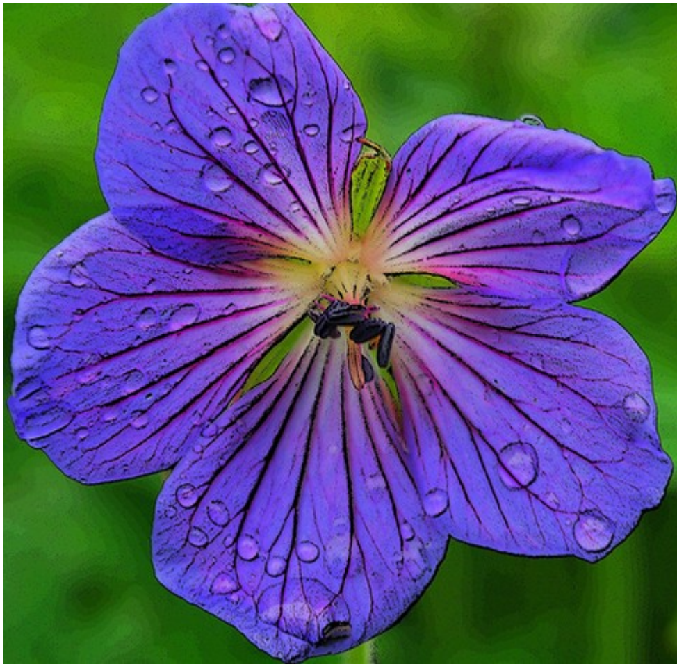
Beautiful Himalayan Flower Inside the Park