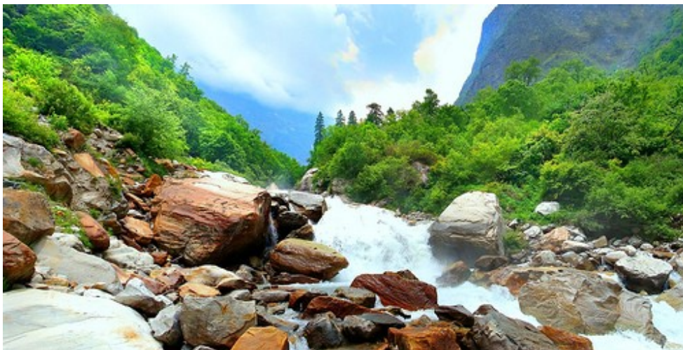
Along The Trekking Route To The Valley Of Flowers

The holy Hindu town of Badrinath is only 14 kilometers (8.6 miles) from Joshimath and can easily be visited on a day trip from there. The town features a striking temple dedicated to Lord Vishnu .