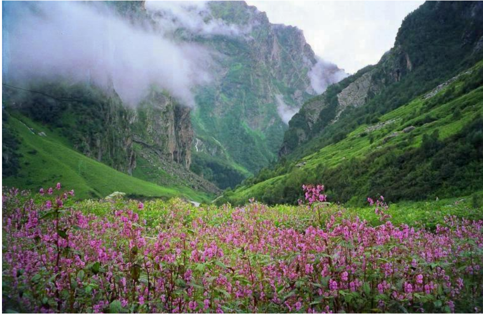
The Magical Valley Of Flowers